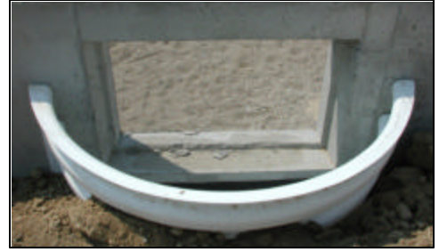
Shown – White WW-42100 52" width x 19" projection x 31" height