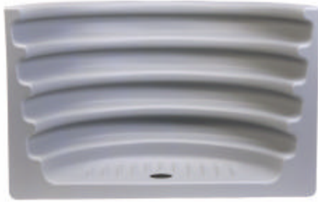
Shown – Granite WW-42115 52" width x 19" projection x 31" height