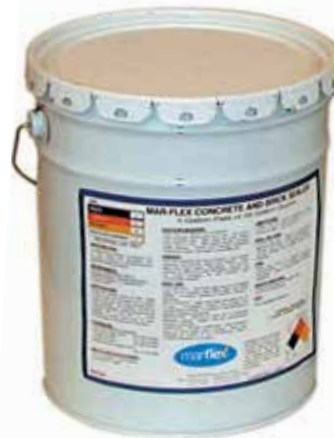
ArmorMasonry Concrete and Brick Sealer CWSS-0005 5 Gallon Bucket Each or 42/Pallet