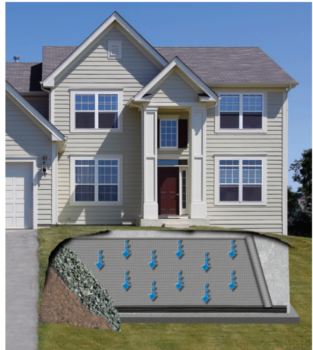
3-Way Foundation Protection: Breathability. Impermeability. Drainage. The "BID" Benefits.

Mar-flex GeoMat provides superior protection and unmatched cost savings when compared to conventional construction techniques typically used to provide similar protection. GeoMat is a good environmental choice, for now and the future, "Superior by design."