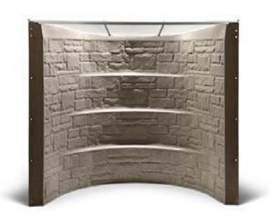
Stonewell Egress Window Well WW-44440 – Sandstone (Shown with optional cover*)