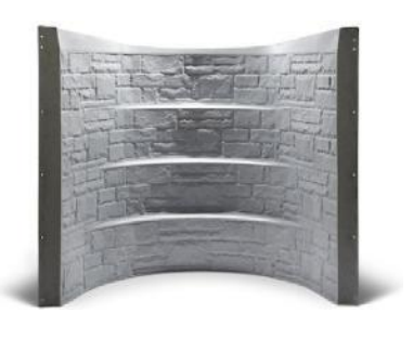
Stonewell Egress Window Well WW-44430 - Granite