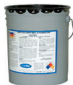
Mar-flex LiteFUSION (Water-Based) RWW-01-5 5 Gallon Bucket Each or 36/Pallet