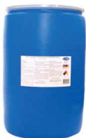
Mar-flex LiteFUSION (Water-Based) RWW-01-55 55 Gallon Drum Each or 4/Pallet